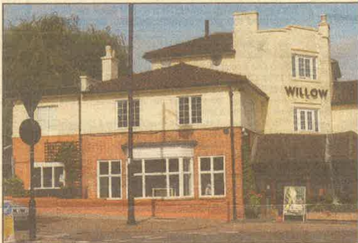
Noisy neighbour: Complaints were made about patrons of Willow, in